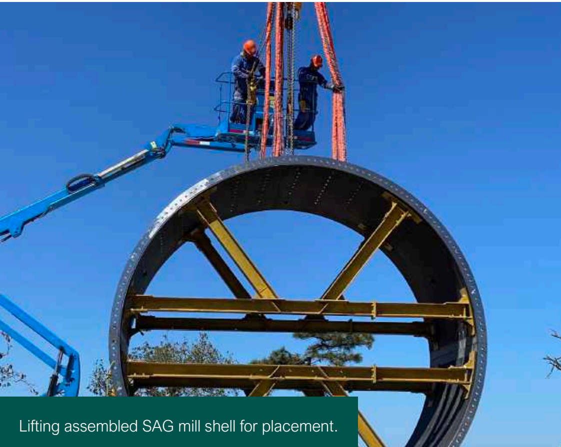
Lifting assembled SAG mill shell for placement.