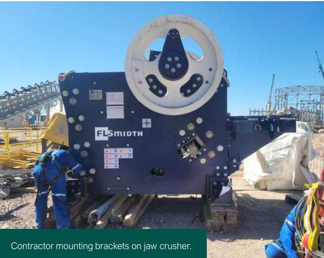
Contractor mounting brackets on jaw crusher.