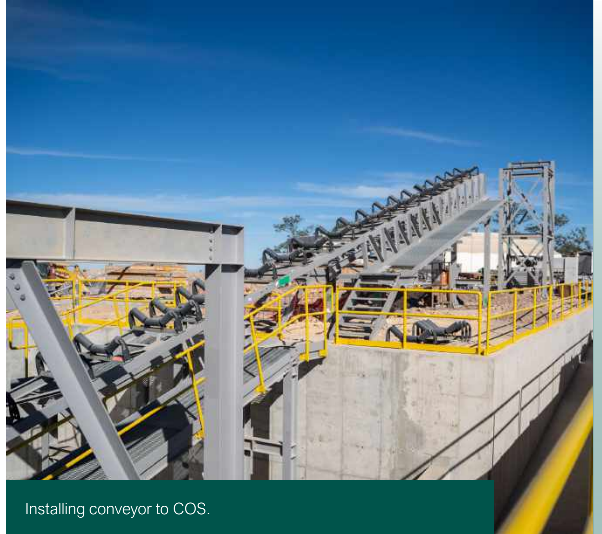
Installing conveyor to COS.