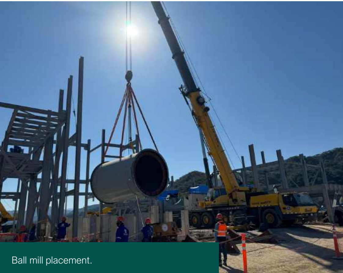
Ball mill placement.