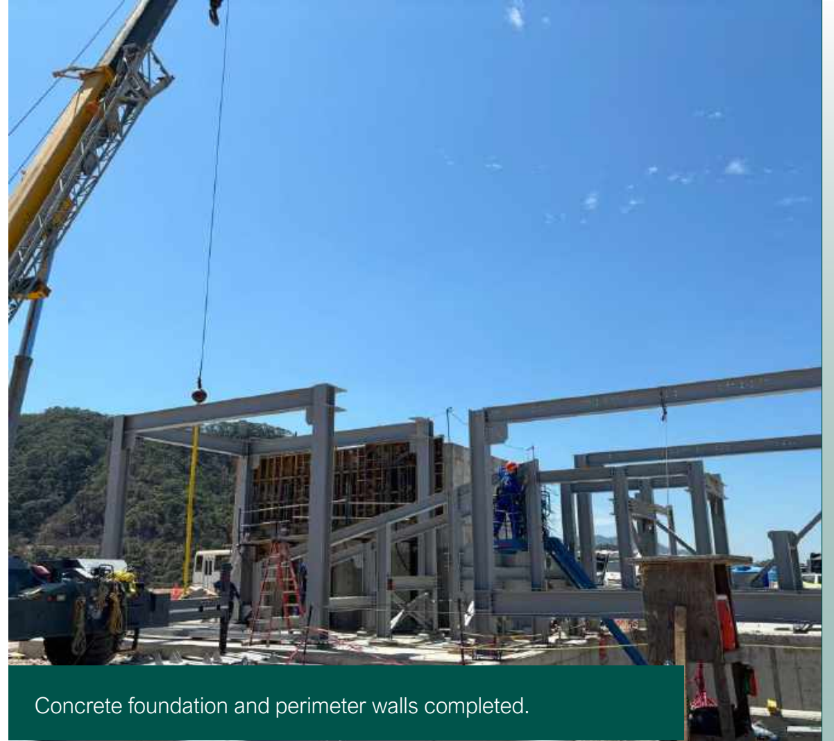
Concrete foundation and perimeter walls completed.