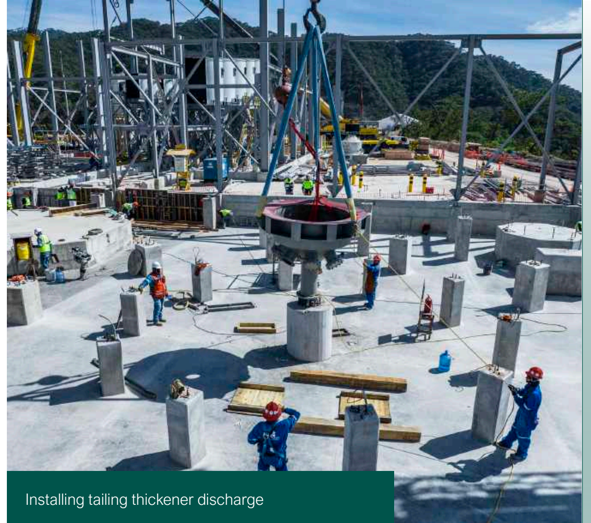
Installing tailing thickener discharge