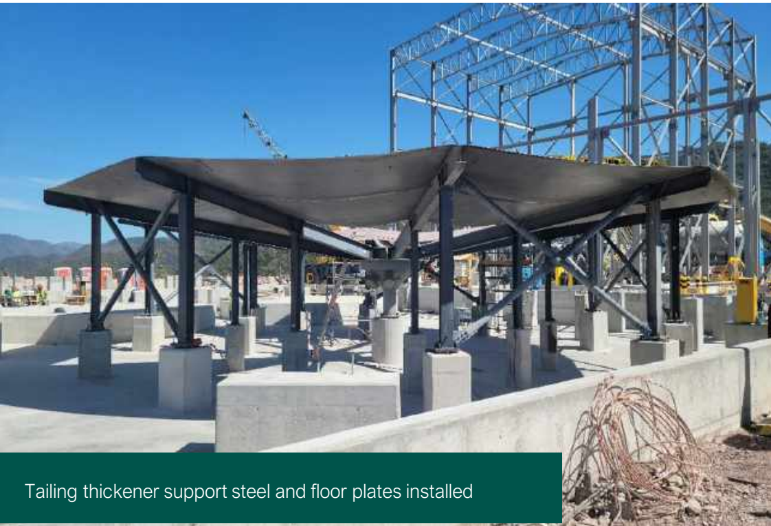
Tailing thickener support steel and floor plates installed