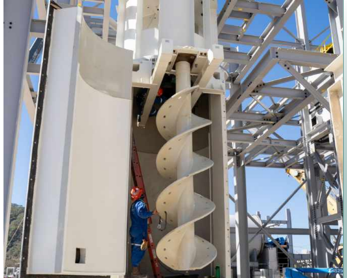
Regrind vertimill with agitation screw in place.