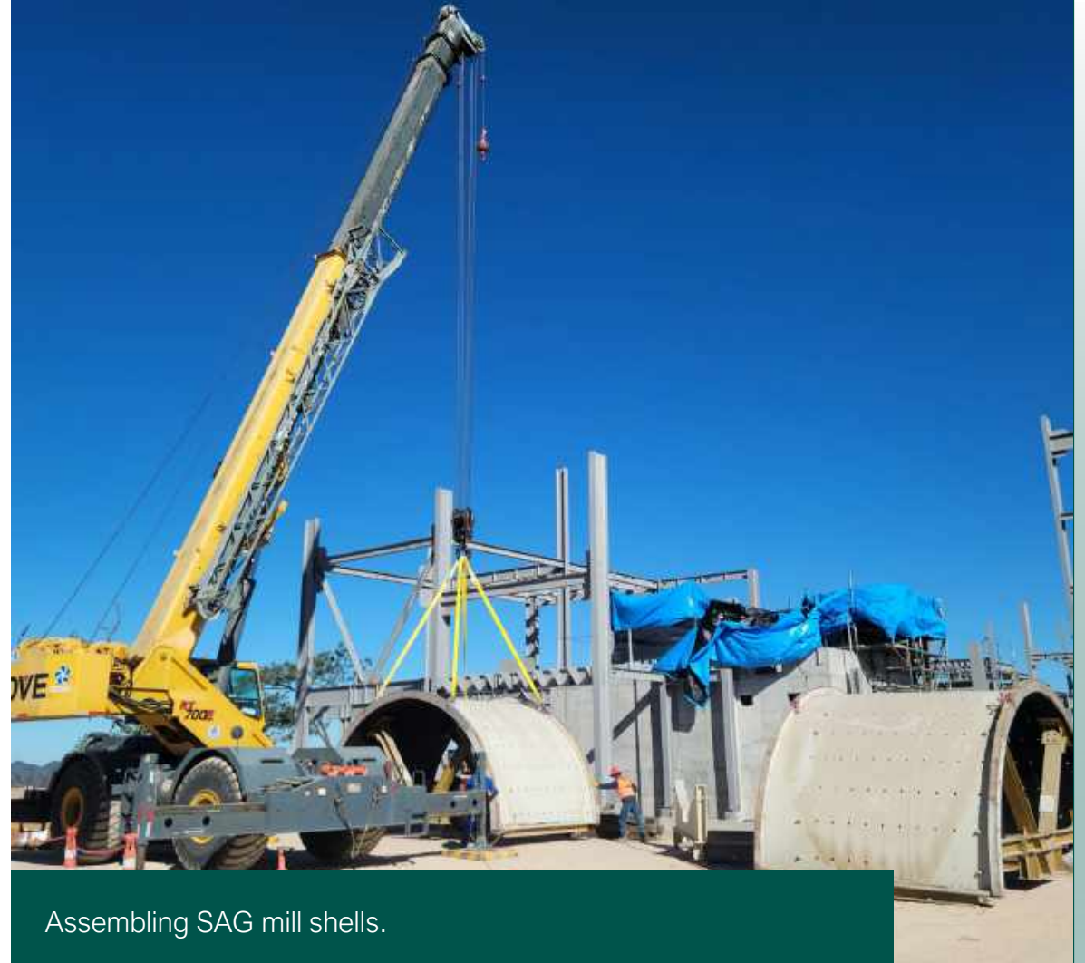
Assembling SAG mill shells.