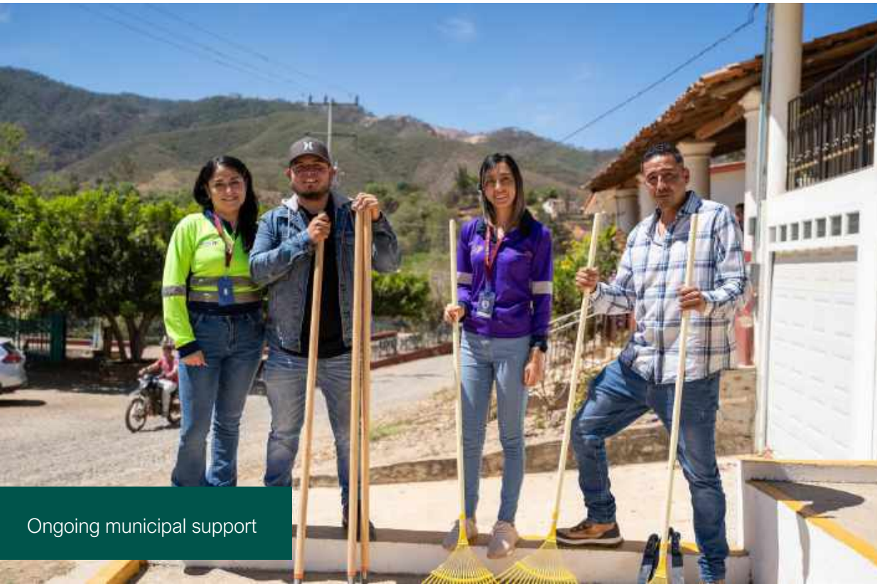
Ongoing municipal support