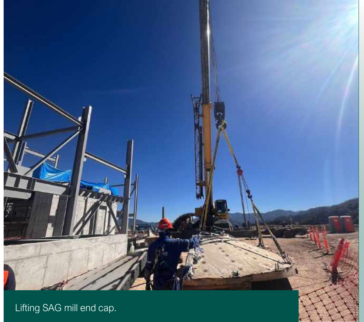
Lifting SAG mill end cap.