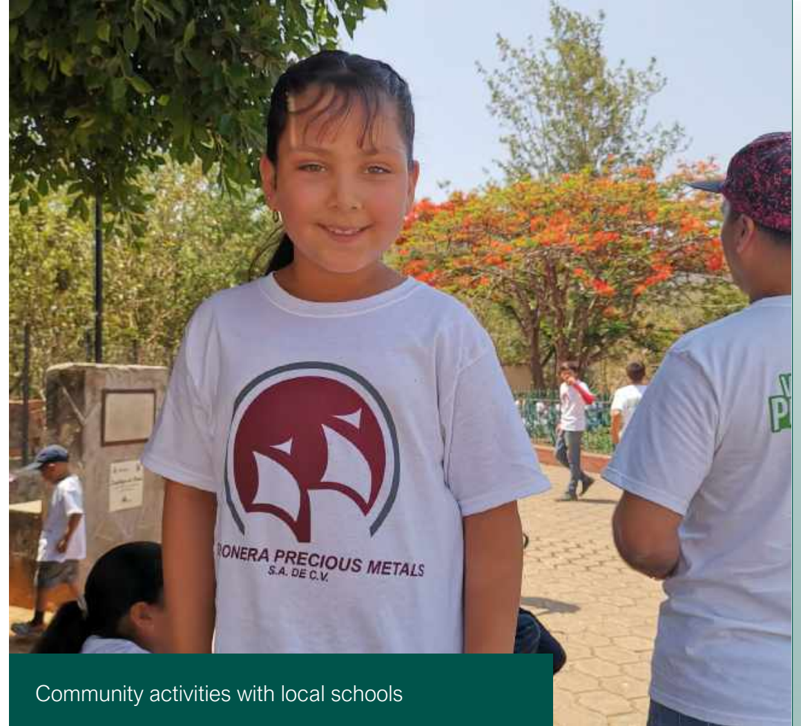
Community activities with local schools

Supporting the local municipality has continued to be a major commitment. A new miner training program for local community members was established to provide training and employment.