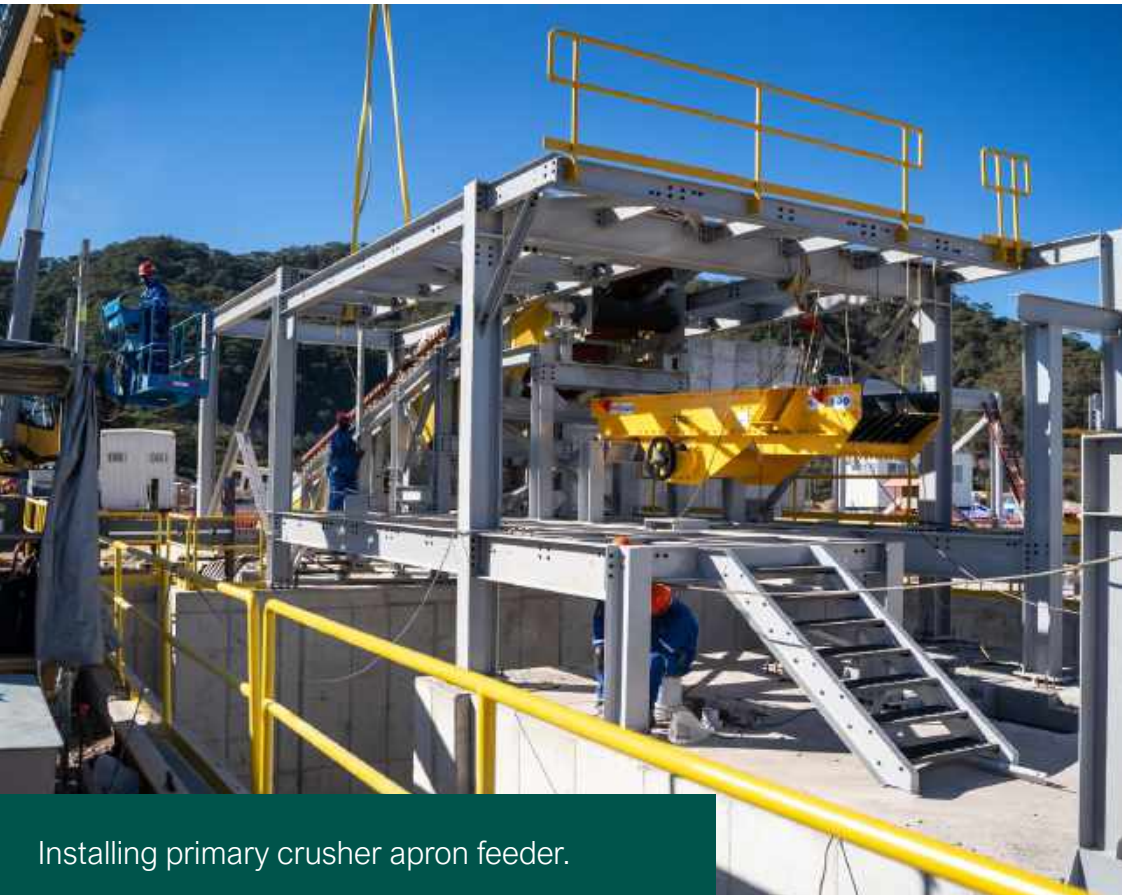
Installing primary crusher apron feeder.